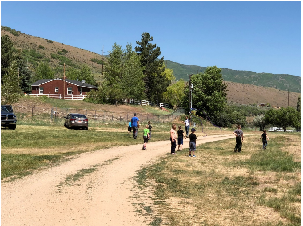
Old Church Campground near Rockport Res.